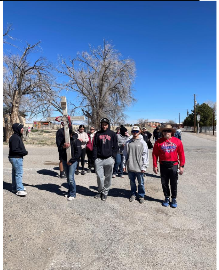
The Joy of the Lord is My Strength!!! “La Vida es un Oración”