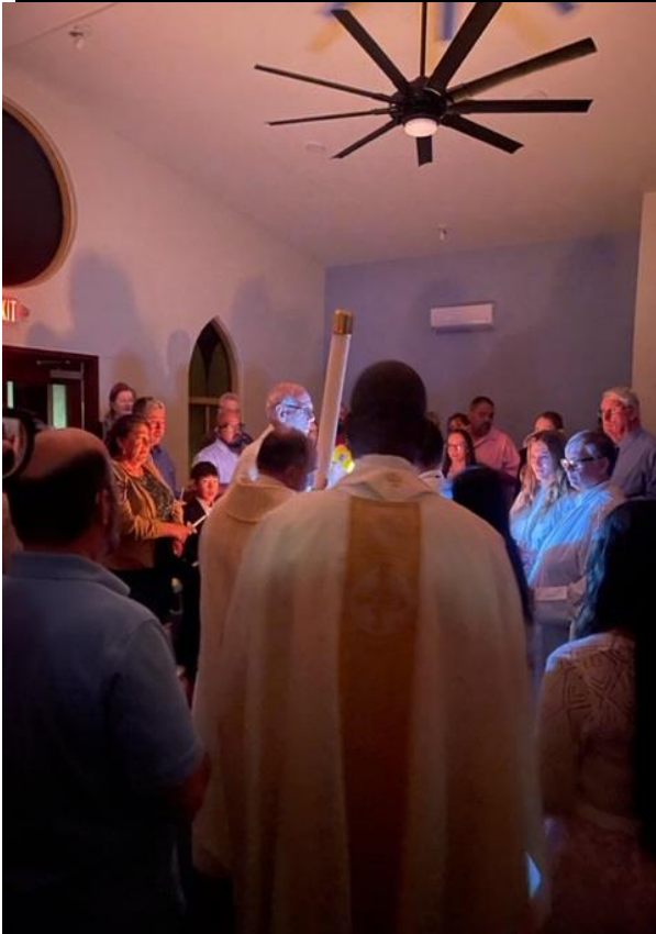
Alleluia! Alleluia! Give Thanks to the Risen Lord!