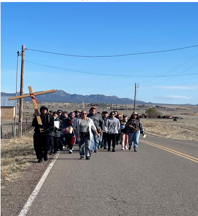
Walking By Faith on Good Friday! Christ is the 1 st Step of the Rest of Our Life!!!